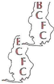
Exhibit B to Resolution #2021-036