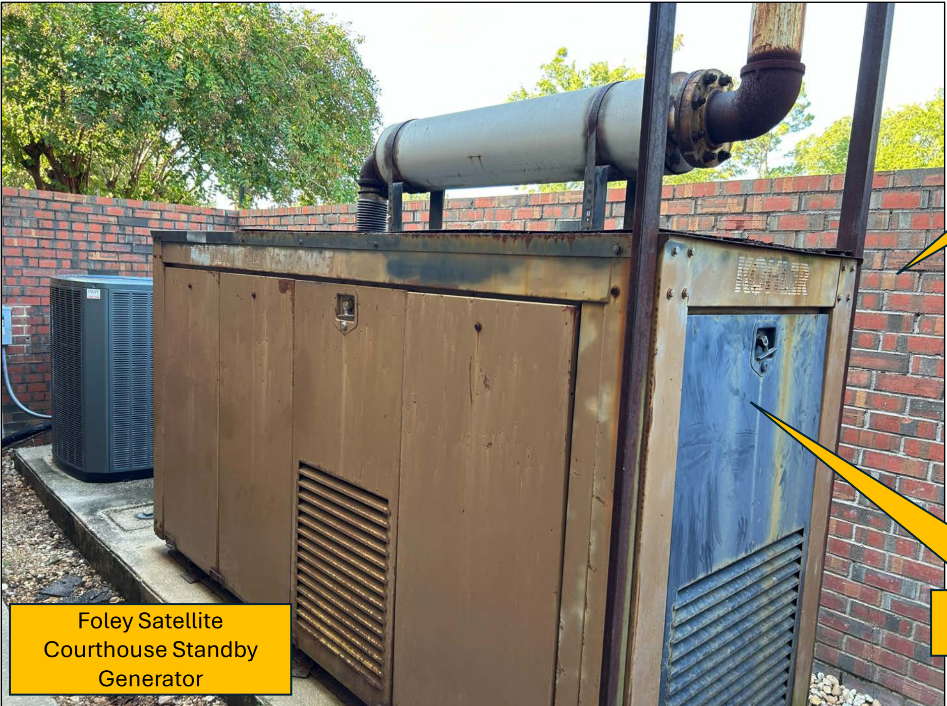
Foley Satellite Courthouse Standby Generator